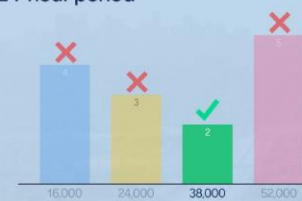
Number of responders in harm's way at an incident scene in a 24-hour period