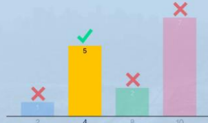
Number of minutes added to traffic delay for every minute a lane is blocked due to a traffic incident