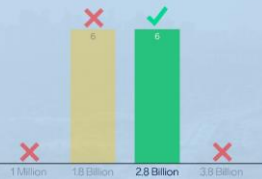
Gallons of fuel wasted annually by Americans idling in incident-related traffic