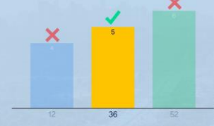
Number of hours the average American commuter spends idling in traffic every year