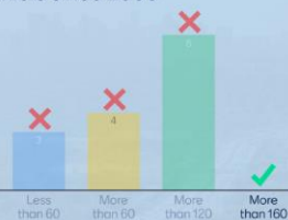
Number of law enforcement officers killed being struck by a vehicle since 2000