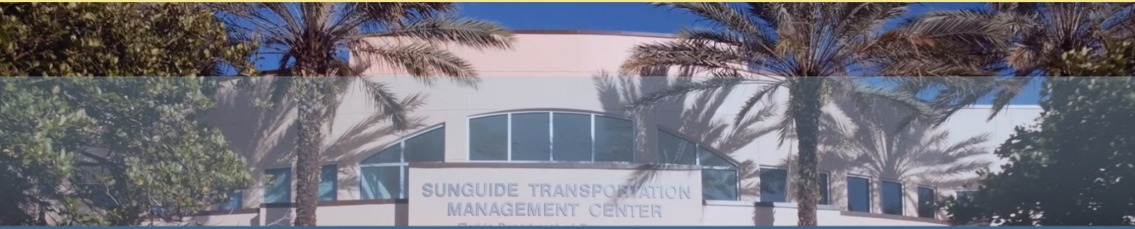
SUNGUIDE TRANSPORTATION MANAGEMENT CENTER