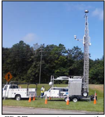
FDOT communications trailer deployment in District Three.

As the trailer has transitioned from a public WiFi service investigation tool to a full-time ITS and emergency operations support tool, the need to support sophisticated public WiFi access controls has diminished. The communications trailer will still provide secure WiFi