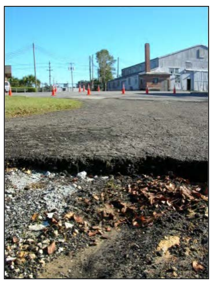
Examples of areas needing repair.