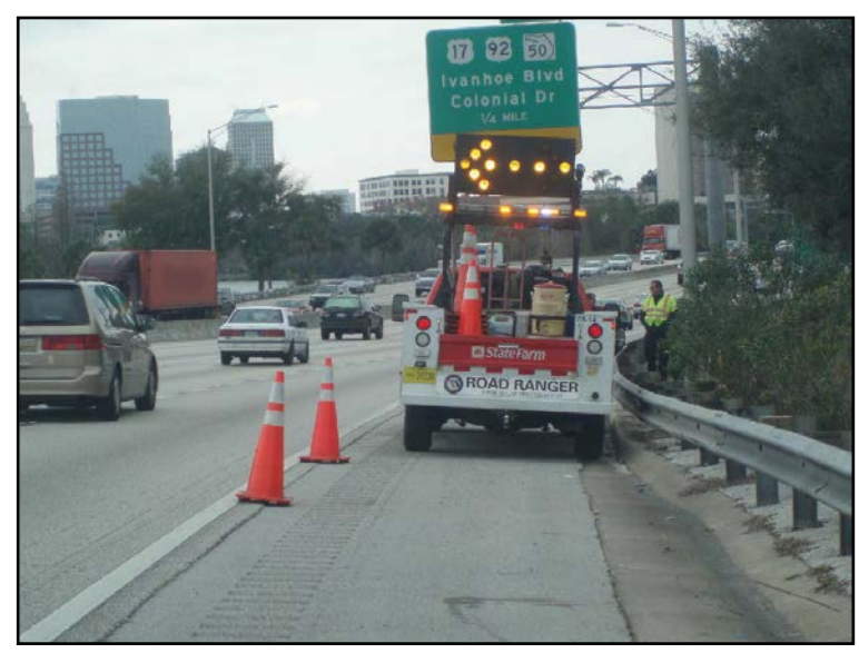
Road Ranger serverice patrol assisting disabled motorist.

We all know that secondary crashes pose safety risks to incident responders and all motorists; quick clearance of traffic incidents promotes safety and vehicle removal, moveover laws, and quick clearance policies minimize exposure and the potential for secondary crashes. What we need to make sure everyone is aware of is that we realize that damage to vehicles or cargo may occur as a result of clearing the roadway on an urgent basis. But as long as reasonable attempts are made to avoid damage, the priority of responders is to safely restore traffic to normal conditions because traffic incident-related congestion has an enormous cost to society.