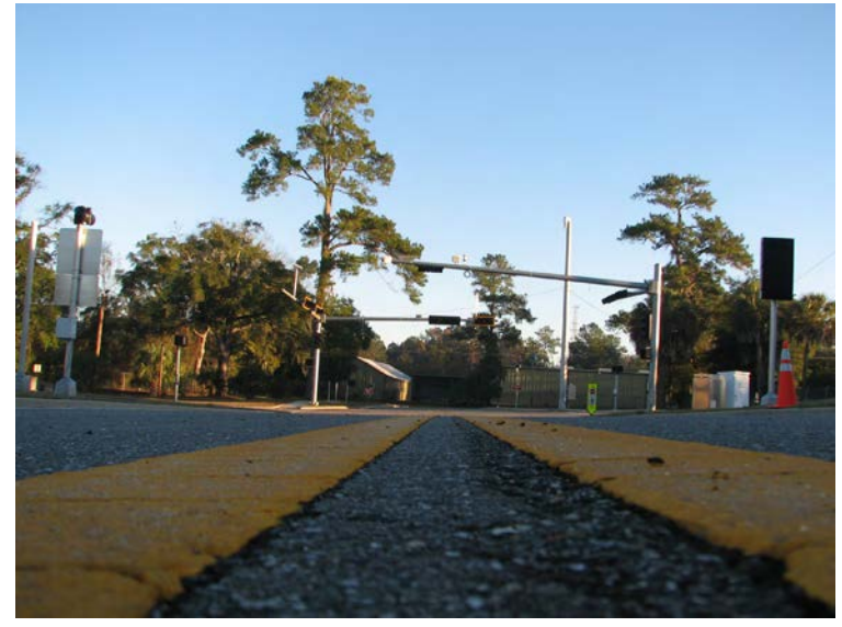
Newer mast arm intersection.