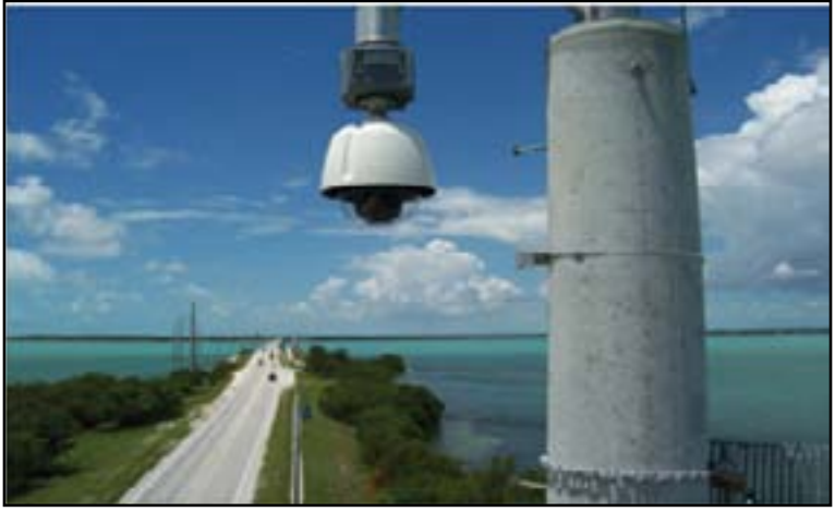
Closed-circuit television camera help with traffic management efforts in Monroe County.

camera feeds available to the public via its Intelligent Transportation Systems (ITS) Program web site, www.sunguide.org. Clickable camera icons that expand to show live traffic feeds to assist with event management and verification were placed on a Google© map platform. With more than 40 cameras available on US-1 and Card Sound Road, this feature will be especially helpful during hurricane evacuation efforts.