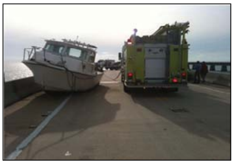
Incident management personnel respond to an event to restore traffic flow.

At the top of the June meeting agenda was a discussion of the team's progress during the past fiscal year (FY) 2010/2011 and a review of their completed action items and milestones achieved. The first item reviewed was the progress made for the county's access to the District's closed-circuit television cameras. District Six made the