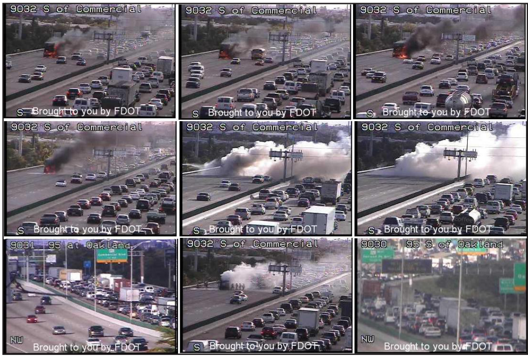
According to the FHWA, every minute a road is closed during peak hours results in four minutes of congestion after the incident is cleared.

A real-life activation of RISC recently occurred in Broward County. On Tuesday, November 30, 2010, at 3:35 p.m., a truck caught fire on northbound I-95 before Commercial Boulevard. The vehicle, which was a compactor-type refuge truck, started spewing flames due to an electrical short in the engine compartment. The driver initially had the ability to drive or steer the vehicle off the roadway, but abandoned the vehicle in the middle lane. Florida Highway Patrol (FHP), Road Rangers, and the Severe Incident Response Vehicle (SIRV) responded and eventually closed all lanes. Fort Lauderdale Fire Rescue responded and quickly extinguished the flames. After approximately 20 minutes, an FHP commander advised the Lake Worth Regional Communications Center to activate RISC. FHP Communications contacted the Broward Regional Transportation Management Center, who contacted the RISC vendor. They gave an estimated time of arrival of 30 minutes. The RISC vendor arrived on scene and the FHP Lieutenant gave the RISC vendor a Notice to Proceed. The RISC vendor cleared the vehicle from the roadway in 17-minutes. The roadway was opened 23-minutes later, after FDOT maintenance fixed the asphalt damage.