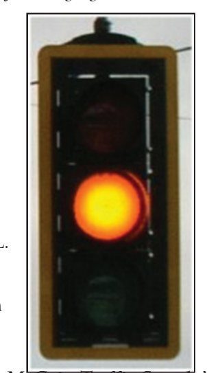
McCain Traffic Supply's retroreflective border backplates